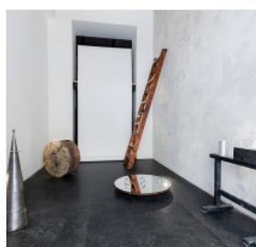
Paradoxical Phenomena in Contemporary Jewelry. A review of Budapest Jewelry Week 2022 Kitti Mayer 20FEB2023