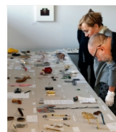
40 Selected Artists at the 3 International Jewellery Competition Gallery of Art in Legnica 16FEB2023