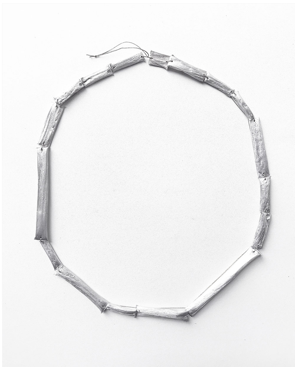
Chien-Yu Liu Necklace: One Moment to Another , 2019 Aluminium, conductive threads. 1.2 x 0.8 x 70 cm