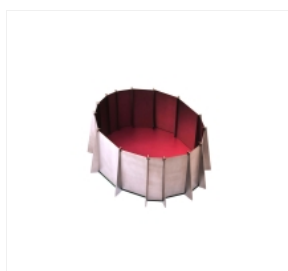
30 Selected Artists at LOEWE FOUNDATION Craft Prize 2023 Loewe Foundation 28FEB2023