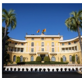
Contemporania, the New High Craftsmanship in the City of Barcelona Klimto2 21FEB2023